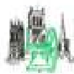
Dove's Guide for Church Bell Ringers

Weather will be sunny, everyone will be in a happy carefree mood ready for some bellringing in excellent company.