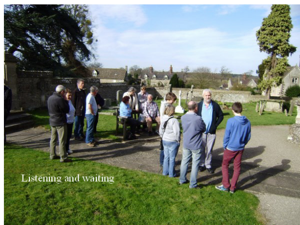
Listening and waiting

There are quite a few more pictures of the afternoon on the branch web site including pictures of the teams as they came down the tower after ringing.