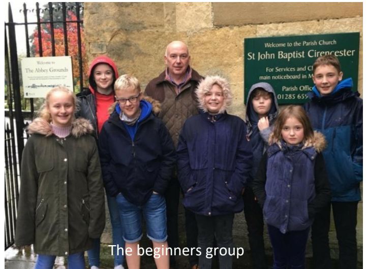
The beginners group