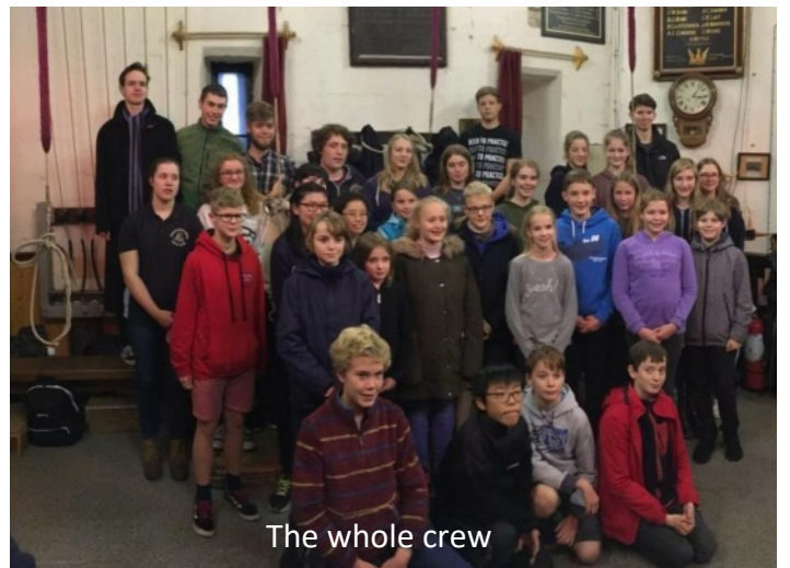
The whole crew